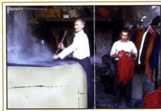
◀ HAND-DYEING THE YARNS